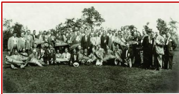
Attendees at Rotary’s first convention in Chicago in 1910. Rotary’s first fiscal year began the day after the convention ended.

Since the executive committee’s decision in 1913, the end of the Rotary year has remained 30 June.